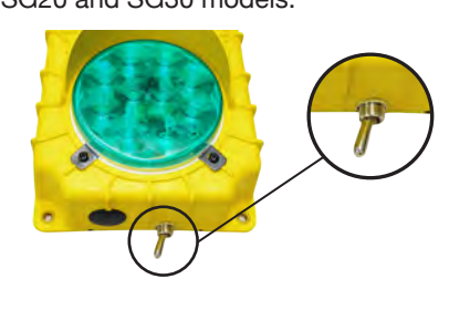
Toggle switch available on SG20 and SG30 models.

Visit us at www.triliteinc.com for a complete list of products and replacement parts.